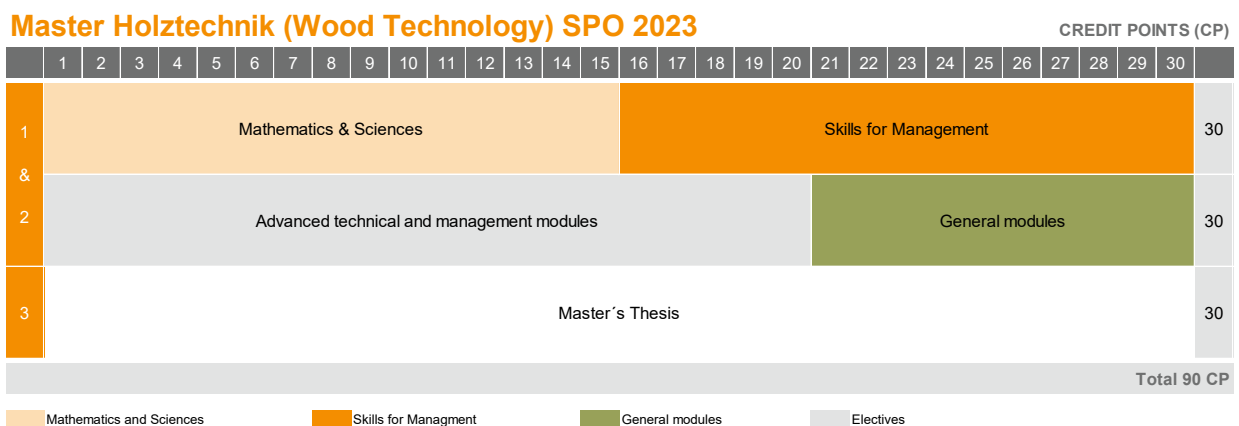
Fig. 1: Schematic representation of the general Programme structure

The program has a modular structure and comprises three semesters for fulltime students, and four to six semesters if completed part time.