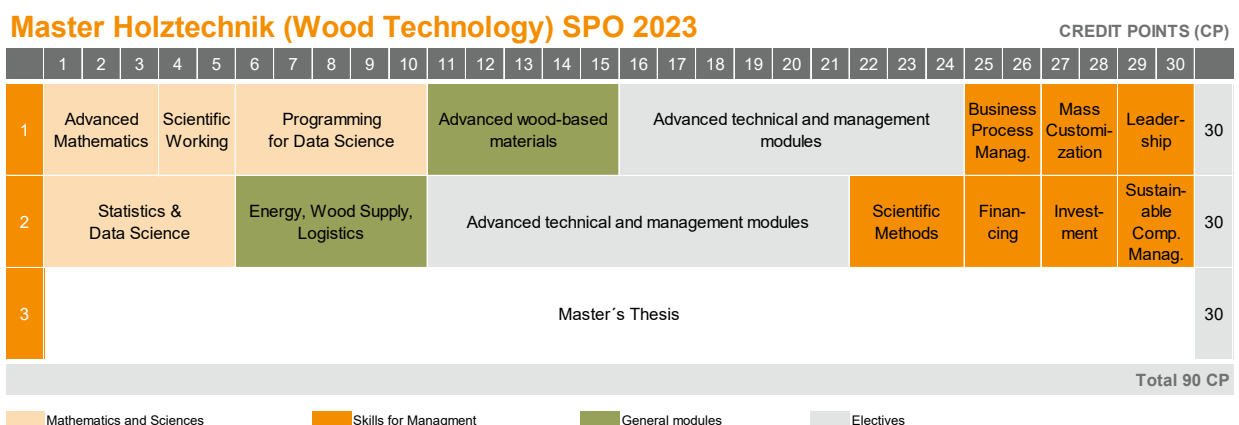
Fig. 2: Schematic representation of the detailed Programme structure